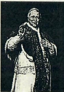
Pope Pius IX